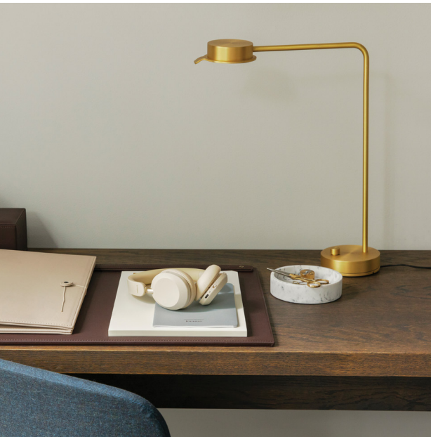
A FEW EXAMPLES OF THE MIX & MATCH ITEMS