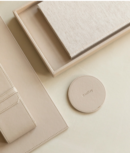
A FEW EXAMPLES OF THE NATURAL ITEMS